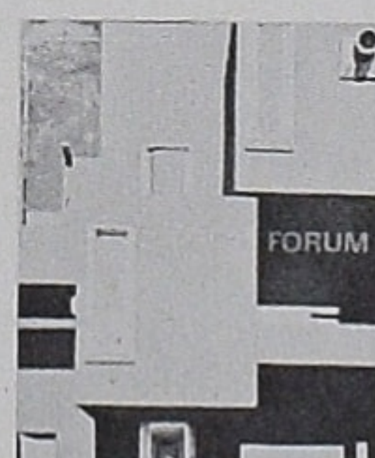
Cover: Apartment building in Sitges, Spain, by Architect Ricardo Bofill.

THE ARCHITECTURAL FORUM Vol. 131 No. 1. July/August issue.